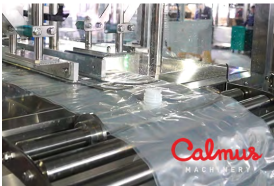
Feeding Empty Bags Continuously