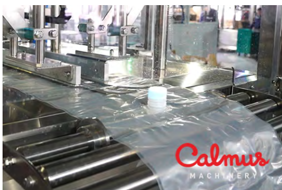
Feeding Empty Bags Continuously